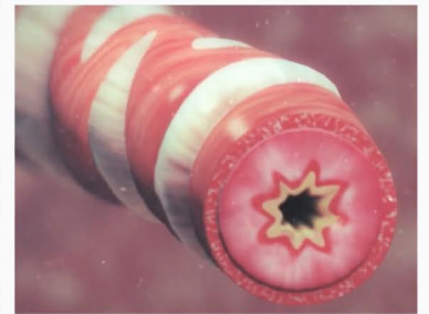
Closed Airways high resistance

Compare pre-and post-bronchodilator results to assess reversibility of condition.