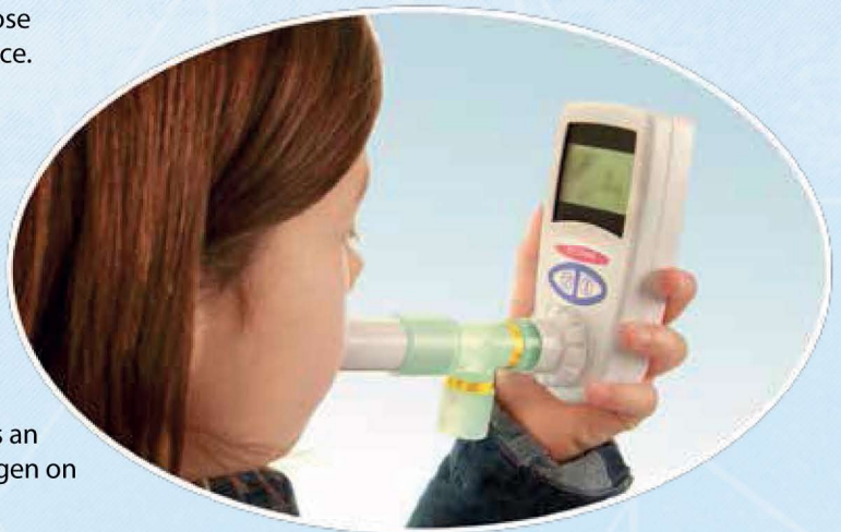
A simple breath test using the H 2 Check

The H 2 Check can be used on all age groups and types of patients. A face mask can be used on patients that are not able to comply with tidal breathing through a standard cardboard mouthpiece test.